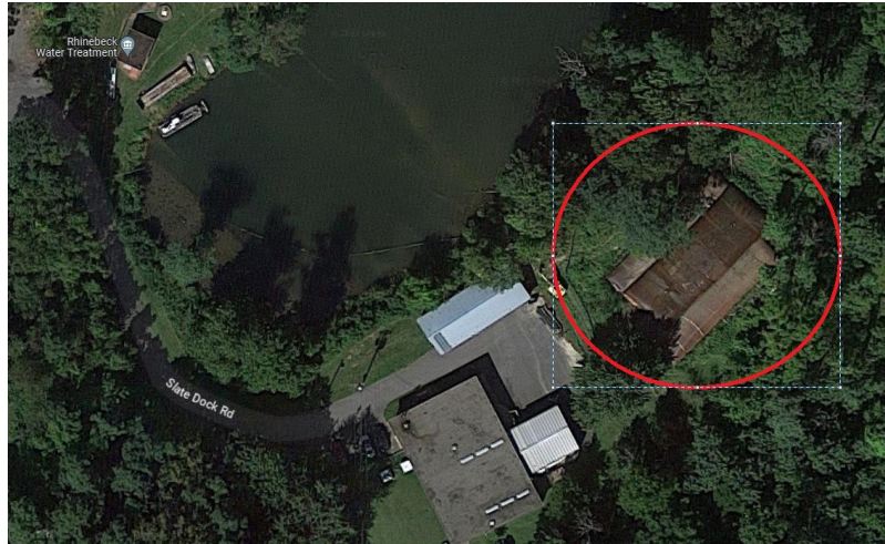
Figure 1 - Aerial view of bagged biosolids